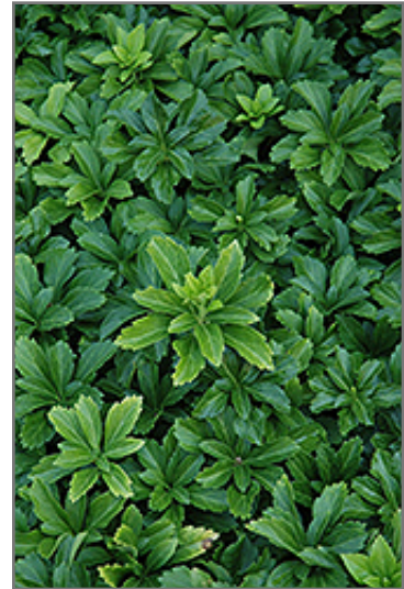
Green Sheen Japanese Spurge foliage