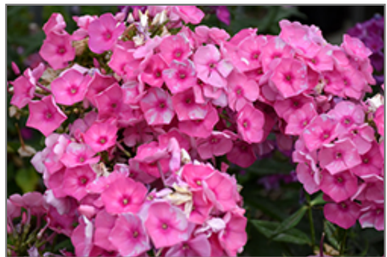
Bubble Gum Pink Garden Phlox flowers