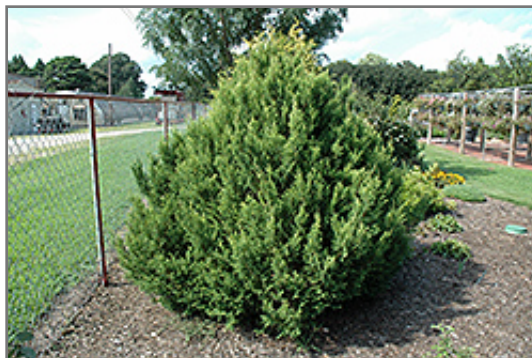
Cream Ball Falsecypress

Cream Ball Falsecypress is recommended for the following landscape applications;