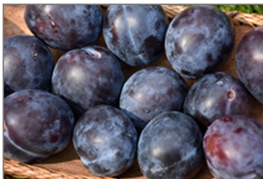
Mount Royal Plum fruit