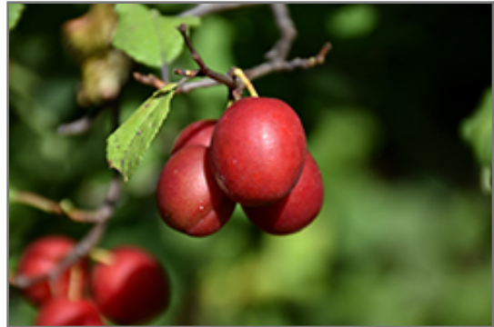
Toka Plum fruit