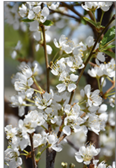
Toka Plum flowers