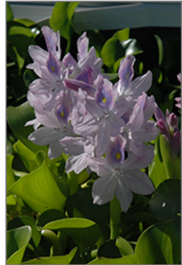
Water Hyacinth flowers