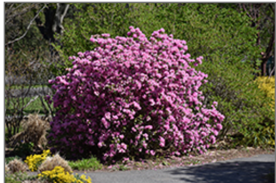
P.J.M. Elite Rhododendron in bloom