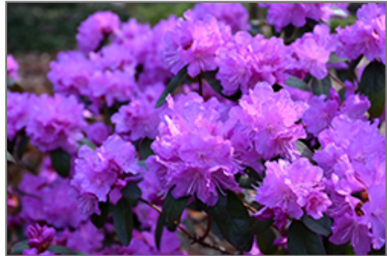
P.J.M. Elite Rhododendron flowers

P.J.M. Elite Rhododendron is recommended for the following landscape applications;