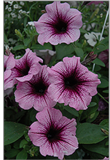
Supertunia Bordeaux Petunia flowers

Supertunia Bordeaux Petunia is recommended for the following landscape applications;