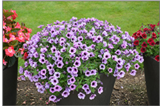
Supertunia Bordeaux Petunia in bloom

Supertunia Bordeaux Petunia will grow to be about 10 inches tall at maturity, with a spread of 24 inches. When grown in masses or used as a bedding plant, individual plants should be spaced approximately 20 inches apart. Its foliage tends to remain low and dense right to the ground. This fast-growing annual will normally live for one full growing season, needing replacement the following year.