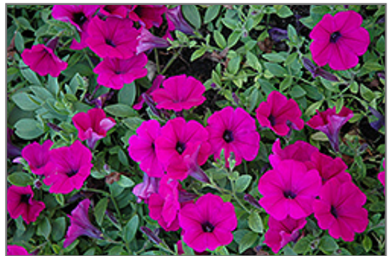
Wave Purple Classic Petunia flowers