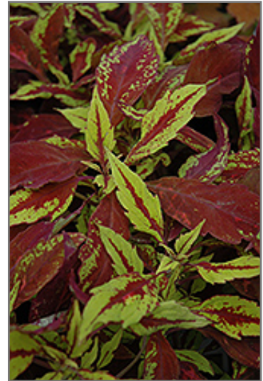
Pineapple Coleus foliage