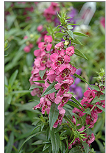
Pink Angelonia flowers