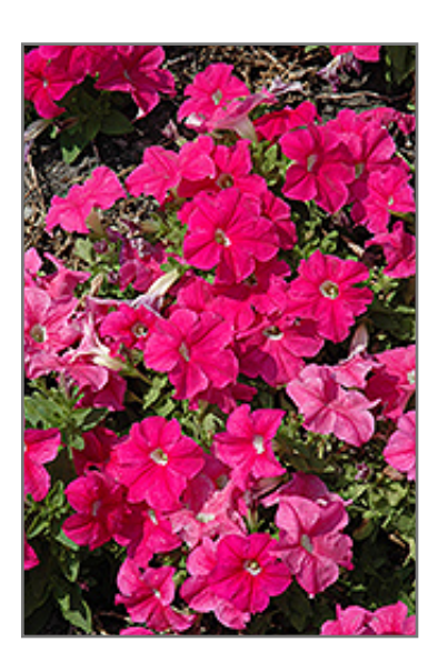
Pretty Grand Deep Pink Petunia flowers

Pretty Grand Deep Pink Petunia will grow to be about 8 inches tall at maturity, with a spread of 12 inches. When grown in masses or used as a bedding plant, individual plants should be spaced approximately 10 inches apart. Its foliage tends to remain low and dense right to the ground. This fast-growing annual will normally live for one full growing season, needing replacement the following year.