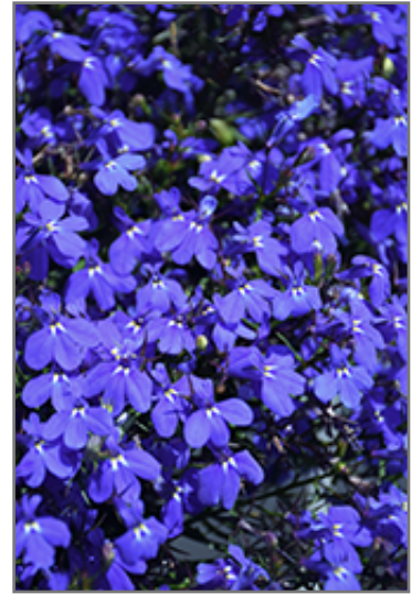
Techno Blue Lobelia flowers

Techno Blue Lobelia is recommended for the following landscape applications;