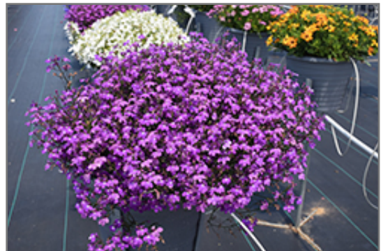
Techno Violet Lobelia in bloom