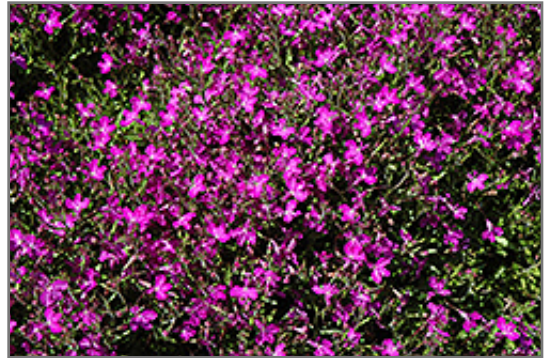
Techno Violet Lobelia flowers

Techno Violet Lobelia will grow to be about 8 inches tall at maturity, with a spread of 12 inches. When grown in masses or used as a bedding plant, individual plants should be spaced approximately 10 inches apart. Its foliage tends to remain low and dense right to the ground. Although it's not a true annual, this fast-growing plant can be expected to behave as an annual in our climate if left outdoors over the winter, usually needing replacement the following year. As such, gardeners should take into consideration that it will perform differently than it would in its native habitat.