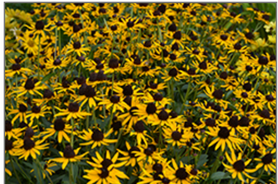
Little Goldstar Coneflower flowers