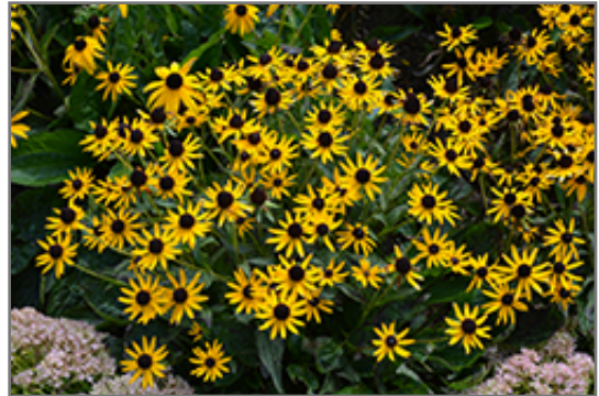
Little Goldstar Coneflower in bloom

This is a relatively low maintenance plant, and should be cut back in late fall in preparation for winter. It is a good choice for attracting butterflies to your yard, but is not particularly attractive to deer who tend to leave it alone in favor of tastier treats. It has no significant negative characteristics.