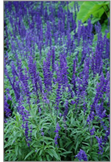
Victoria Blue Salvia flowers

Victoria Blue Salvia is a fine choice for the garden, but it is also a good selection for planting in outdoor pots and containers. With its upright habit of growth, it is best suited for use as a 'thriller' in the 'spiller-thriller-filler' container combination; plant it near the center of the pot, surrounded by smaller plants and those that spill over the edges. Note that when growing plants in outdoor containers and baskets, they may require more frequent waterings than they would in the yard or garden.