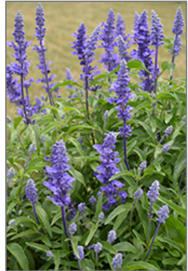
Victoria Blue Salvia flowers

Victoria Blue Salvia is recommended for the following landscape applications;