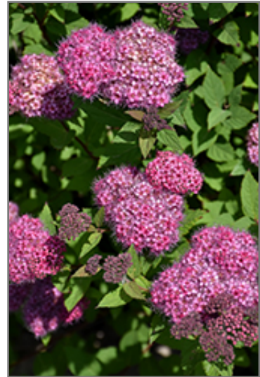
Double Play Artisan Spirea flowers

Double Play Artisan Spirea is recommended for the following landscape applications;