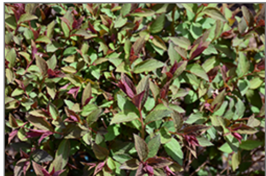
Double Play Artisan Spirea foliage