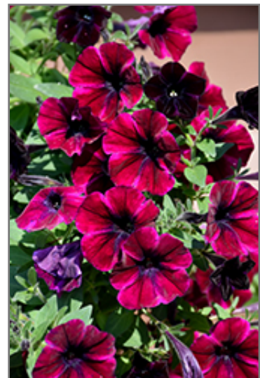
Sweetunia Johnny Flame Petunia flowers