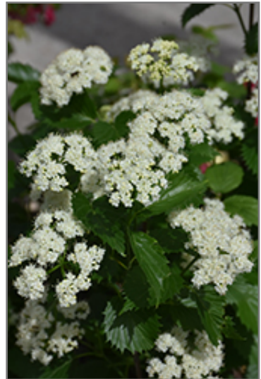
Blue Muffin Viburnum flowers