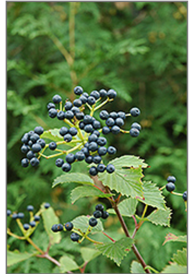
Blue Muffin Viburnum fruit

Blue Muffin Viburnum is recommended for the following landscape applications;