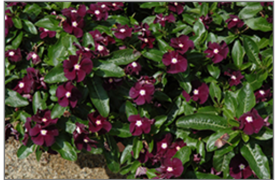
Jams 'N Jellies Blackberry Vinca flowers

Jams 'N Jellies Blackberry Vinca is recommended for the following landscape applications;