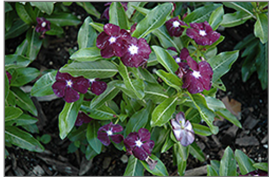
Jams 'N Jellies Blackberry Vinca flowers

Jams 'N Jellies Blackberry Vinca is recommended for the following landscape applications;