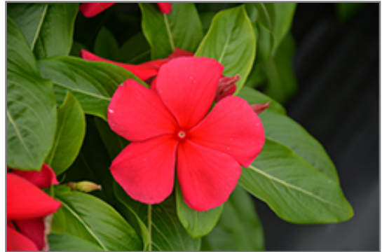
Titan Dark Red Vinca flowers

Titan Dark Red Vinca is recommended for the following landscape applications;