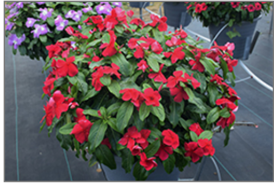
Titan Dark Red Vinca in bloom

Titan Dark Red Vinca will grow to be about 14 inches tall at maturity, with a spread of 12 inches. Its foliage tends to remain dense right to the ground, not requiring facer plants in front. Although it's not a true annual, this fast-growing plant can be expected to behave as an annual in our climate if left outdoors over the winter, usually needing replacement the following year. As such, gardeners should take into consideration that it will perform differently than it would in its native habitat.