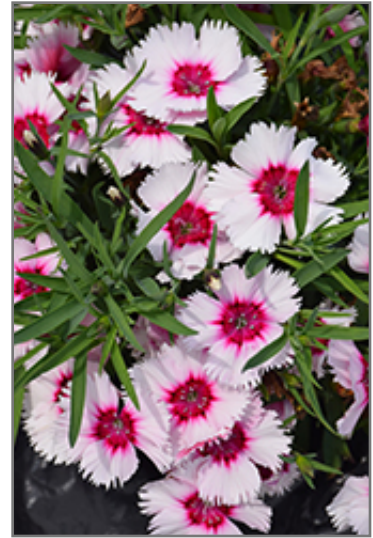
Super Parfait Raspberry Pinks flowers

Super Parfait Raspberry Pinks is a fine choice for the garden, but it is also a good selection for planting in outdoor pots and containers. It is often used as a 'filler' in the 'spiller-thriller-filler' container combination, providing a mass of flowers and foliage against which the thriller plants stand out. Note that when growing plants in outdoor containers and baskets, they may require more frequent waterings than they would in the yard or garden.