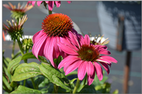
Cheyenne Spirit Coneflower flowers

Cheyenne Spirit Coneflower will grow to be about 16 inches tall at maturity extending to 24 inches tall with the flowers, with a spread of 18 inches. Its foliage tends to remain dense right to the ground, not requiring facer plants in front. It grows at a medium rate, and under ideal conditions can be expected to live for approximately 10 years. As an herbaceous perennial, this plant will usually die back to the crown each winter, and will regrow from the base each spring. Be careful not to disturb the crown in late winter when it may not be readily seen!