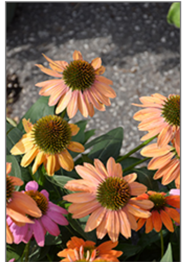
Cheyenne Spirit Coneflower flowers