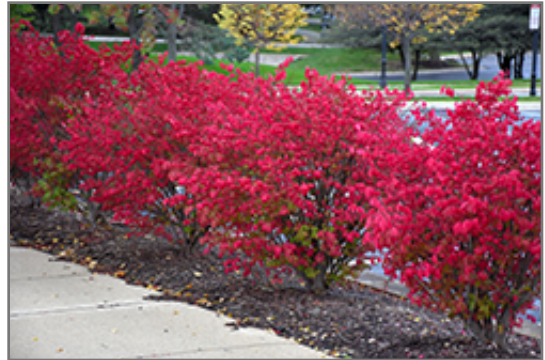
Fire Ball Burning Bush in fall

Fire Ball Burning Bush is recommended for the following landscape applications;