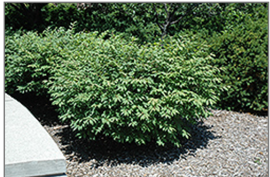
Fire Ball Burning Bush