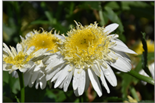
Realflor Real Glory Shasta Daisy flowers

Realflor Real Glory Shasta Daisy is recommended for the following landscape applications;