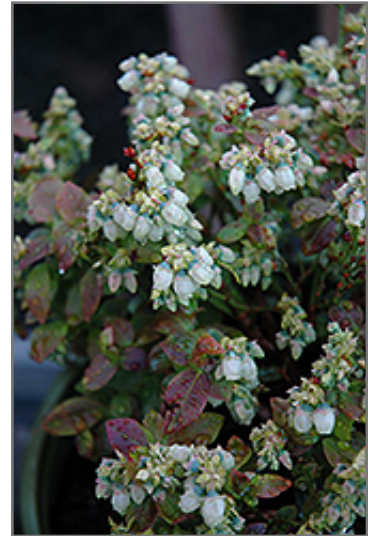
Jelly Bean Blueberry flowers

Jelly Bean Blueberry is a good choice for the edible garden, but it is also well-suited for use in outdoor pots and containers. It can be used either as 'filler' or as a 'thriller' in the 'spiller-thriller-filler' container combination, depending on the height and form of the other plants used in the container planting. It is even sizeable enough that it can be grown alone in a suitable container. Note that when grown in a container, it may not perform exactly as indicated on the tag - this is to be expected. Also note that when growing plants in outdoor containers and baskets, they may require more frequent waterings than they would in the yard or garden.