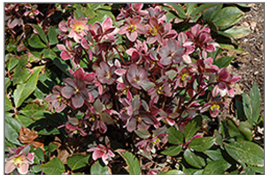
Pink Frost Hellebore in bloom