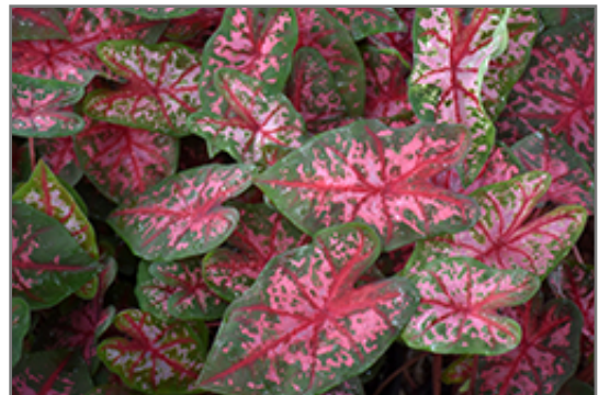
Carolyn Whorton Caladium foliage