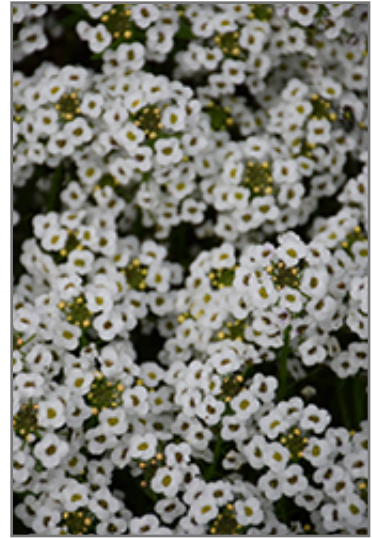
Stream White Sweet Alyssum flowers

Stream White Sweet Alyssum is recommended for the following landscape applications;