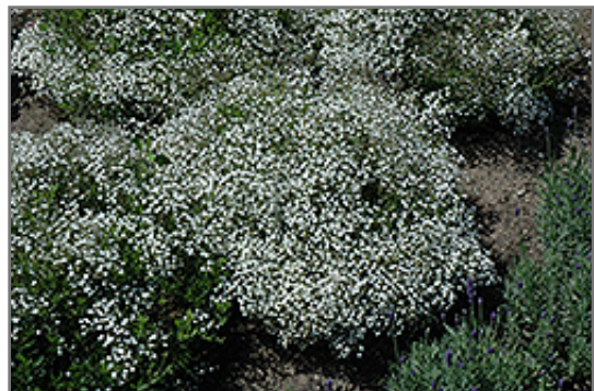
Summer Sparkles Baby's Breath in bloom