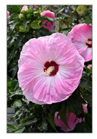
Tie Dye Hibiscus flowers