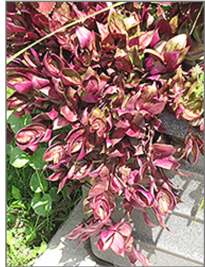
Purple Wandering Jew

Purple Wandering Jew is recommended for the following landscape applications;