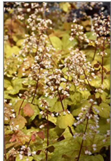
Champagne Coral Bells flowers