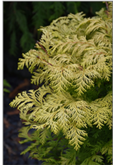
Cripps Gold Falsecypress foliage