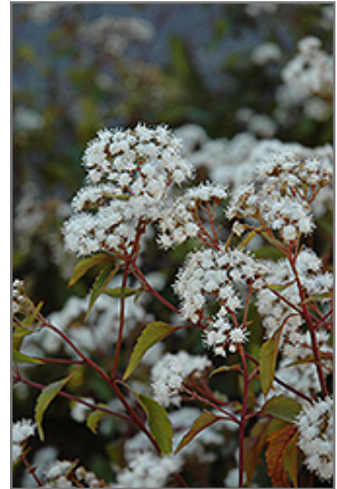
Chocolate Boneset flowers

Chocolate Boneset is recommended for the following landscape applications;