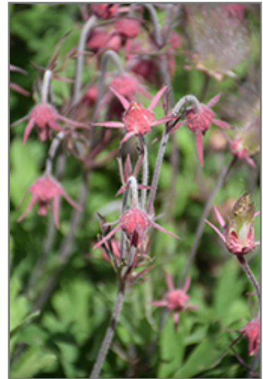
Prairie Smoke flower buds