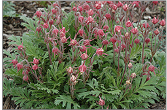
Prairie Smoke in bloom

Prairie Smoke is an herbaceous perennial with an upright spreading habit of growth. Its relatively fine texture sets it apart from other garden plants with less refined foliage.