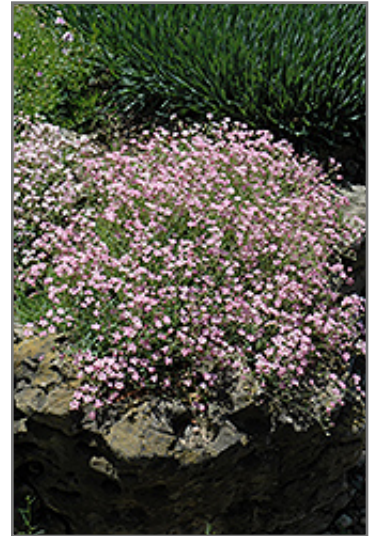
Pink Creeping Baby's Breath in bloom