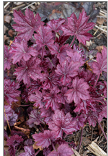
Wild Rose Coral Bells foliage