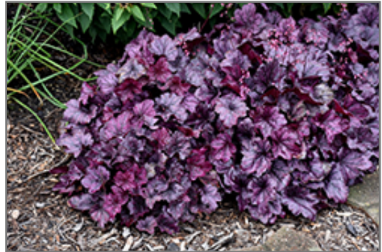
Wild Rose Coral Bells

This is a relatively low maintenance plant, and should be cut back in late fall in preparation for winter. It is a good choice for attracting hummingbirds to your yard. It has no significant negative characteristics.