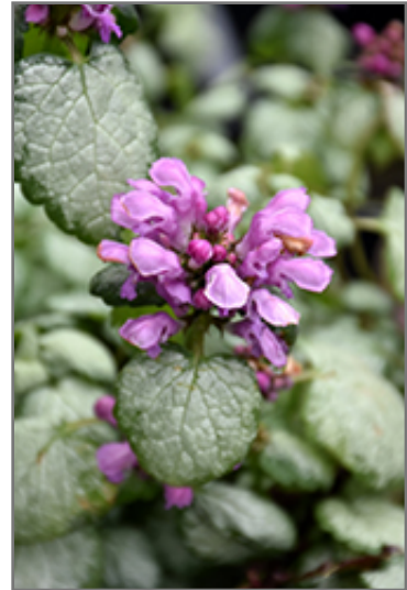
Red Nancy Spotted Dead Nettle flowers