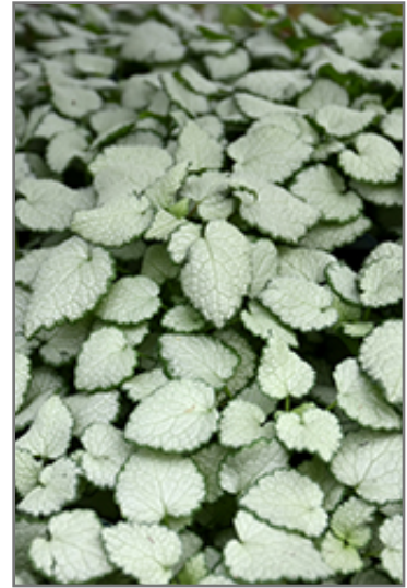
Red Nancy Spotted Dead Nettle foliage

Red Nancy Spotted Dead Nettle is a fine choice for the garden, but it is also a good selection for planting in outdoor pots and containers. Because of its spreading habit of growth, it is ideally suited for use as a 'spiller' in the 'spiller-thriller-filler' container combination; plant it near the edges where it can spill gracefully over the pot. Note that when growing plants in outdoor containers and baskets, they may require more frequent waterings than they would in the yard or garden.