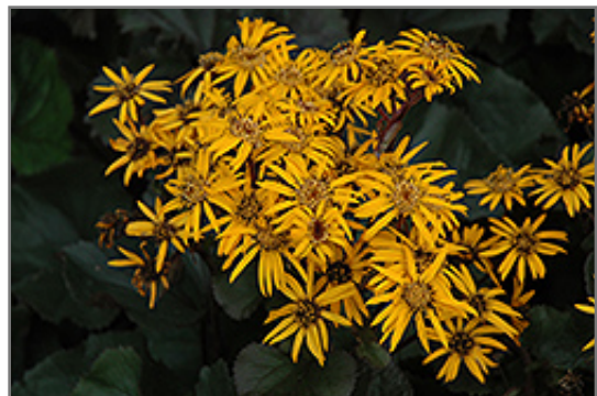
Britt Marie Crawford Rayflower flowers