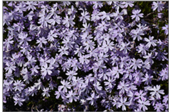
Emerald Blue Moss Phlox flowers