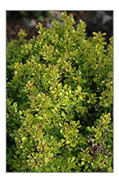
Golden Nugget Japanese Barberry foliage