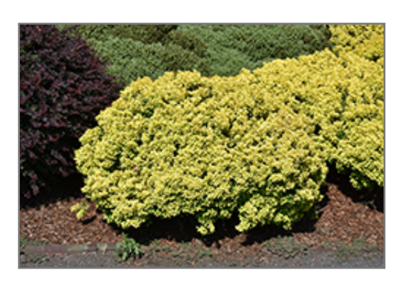
Golden Nugget Japanese Barberry

Golden Nugget Japanese Barberry is recommended for the following landscape applications;