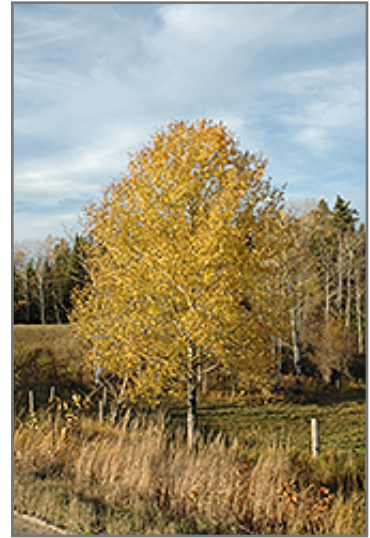
Trembling Aspen in fall

This tree should only be grown in full sunlight. It is an amazingly adaptable plant, tolerating both dry conditions and even some standing water. It is considered to be drought-tolerant, and thus makes an ideal choice for xeriscaping or the moisture-conserving landscape. It is not particular as to soil type or pH. It is quite intolerant of urban pollution, therefore inner city or urban streetside plantings are best avoided. This species is native to parts of North America.