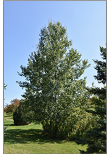
Trembling Aspen

Trembling Aspen is recommended for the following landscape applications;