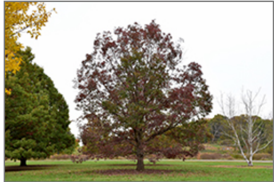
White Oak in fall

This tree should only be grown in full sunlight. It is very adaptable to both dry and moist locations, and should do just fine under average home landscape conditions. It is not particular as to soil type, but has a definite preference for acidic soils. It is highly tolerant of urban pollution and will even thrive in inner city environments. This species is native to parts of North America.