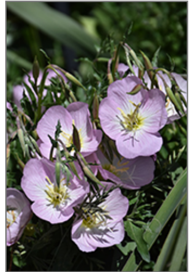
Evening Primrose flowers