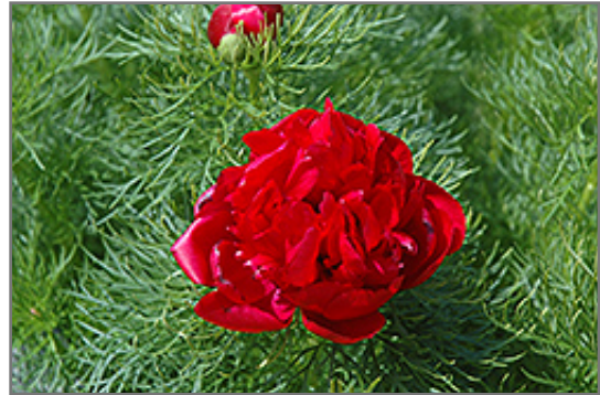
Double Fernleaf Peony flowers