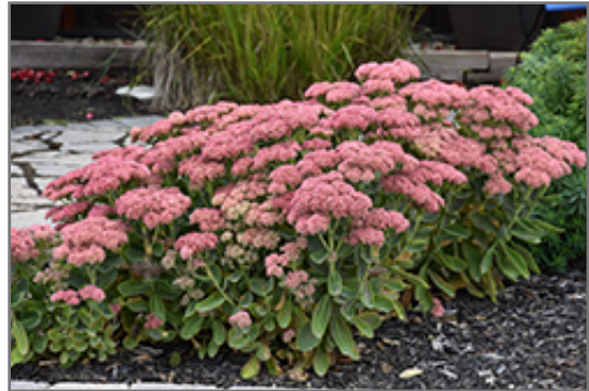
Autumn Fire Stonecrop in bloom

Autumn Fire Stonecrop is recommended for the following landscape applications;