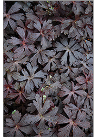
Espresso Cranesbill foliage