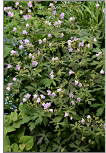
Espresso Cranesbill in bloom

Espresso Cranesbill will grow to be about 18 inches tall at maturity, with a spread of 24 inches. When grown in masses or used as a bedding plant, individual plants should be spaced approximately 20 inches apart. Its foliage tends to remain dense right to the ground, not requiring facer plants in front. It grows at a medium rate, and under ideal conditions can be expected to live for approximately 10 years. As an herbaceous perennial, this plant will usually die back to the crown each winter, and will regrow from the base each spring. Be careful not to disturb the crown in late winter when it may not be readily seen!