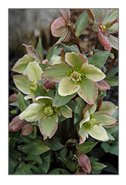
Ivory Prince Hellebore flowers