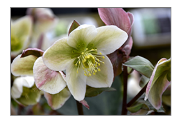
Ivory Prince Hellebore flowers