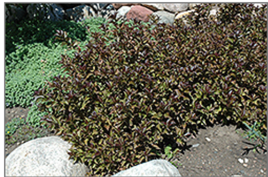
Dark Horse Weigela