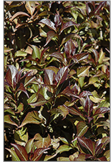
Dark Horse Weigela foliage

Dark Horse Weigela makes a fine choice for the outdoor landscape, but it is also well-suited for use in outdoor pots and containers. Because of its height, it is often used as a 'thriller' in the 'spiller-thriller-filler' container combination; plant it near the center of the pot, surrounded by smaller plants and those that spill over the edges. It is even sizeable enough that it can be grown alone in a suitable container. Note that when grown in a container, it may not perform exactly as indicated on the tag - this is to be expected. Also note that when growing plants in outdoor containers and baskets, they may require more frequent waterings than they would in the yard or garden.